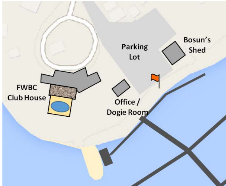
Figure 1 – FWBC Facility Layout